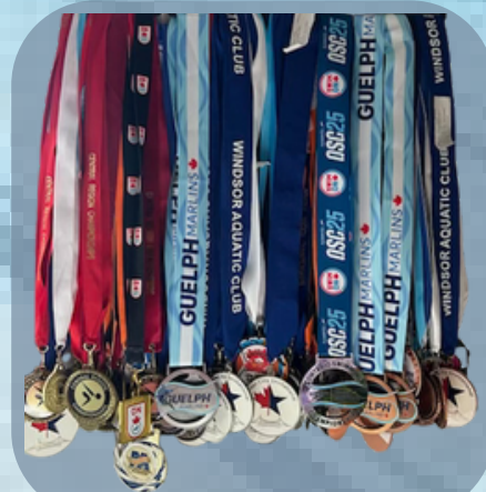
56 HHBF records were broken in 2024-2025 season.