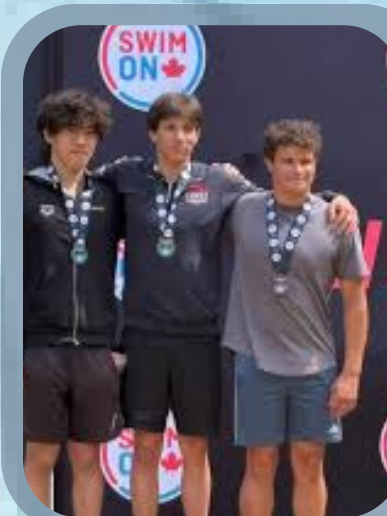
Bronze Medal Ontario Open Water Championships