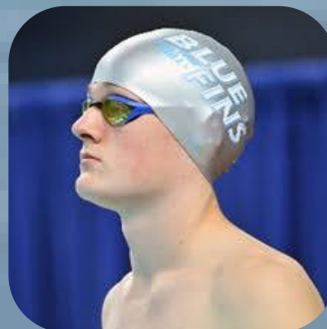
Bronze Medal Ontario Swimming Championships