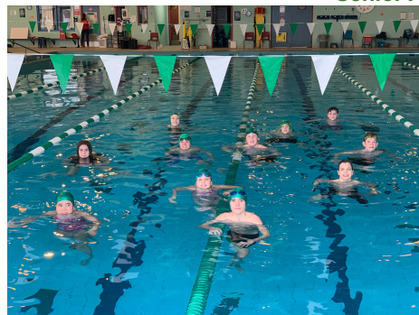
Juniors after a Race Day Workout