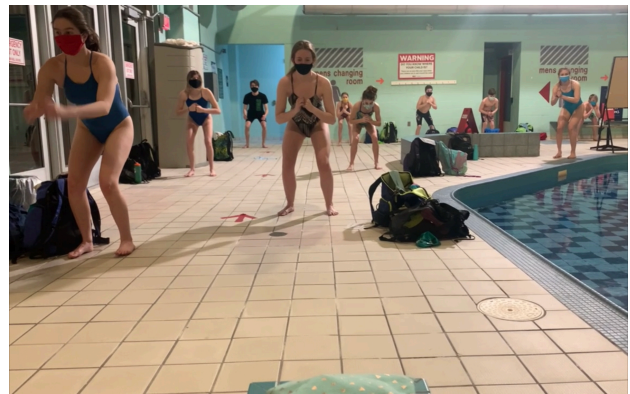
Senior AM Activation

TEAM PRIDE - INTEGRITY - DEDICATION - LEADERSHIP