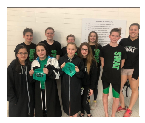
AA SWIMMERS @ THEIR 1STMEET OF '20