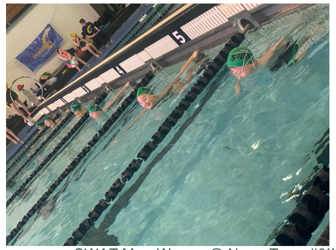
A FULL HEAT OF SWAT MINI-WAVES @ NOVA TECH #3!!!

Team Pride - Integrity - Dedication - Leadership