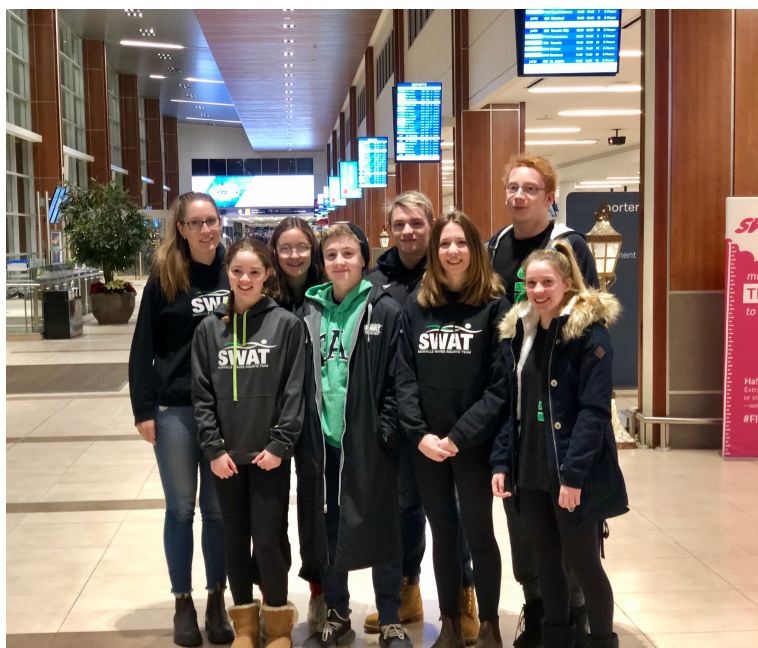
SENIOR SWIMMERS EN ROUTE TO MONTREAL IN DECEMBER

Team Pride – Integrity – Dedication – Leadership