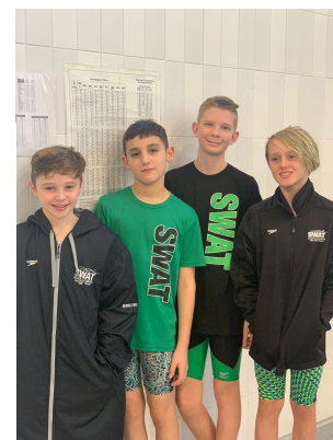
CANDY CANE CLASSIC RELAY EXCITEMENT

“SPORTS GIVE YOU A PART OF YOUR LIFE WHERE YOU CAN WORK AT SOMETHING AND YOU LOOK IN THE MIRROR AND YOU LIKE THAT PERSON ”