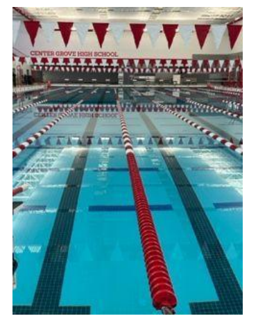
View from behind the starting blocks