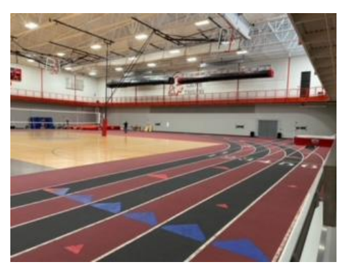
View of adjacent Student Activity Center (enter pool through double gray doors)