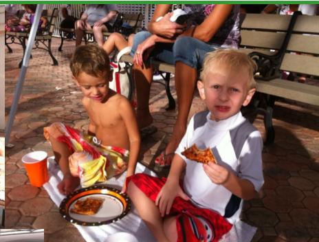
Boca Raton & Ft. Lauderdale Novice Groups during their pizza parties on October 28.