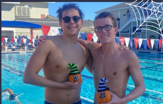
WINDERMERE LAKERS ANNUAL PUMPKIN MEET

Dive into the Halloween spirit at our annual Pumpkin Meet! Expect traditional races and pumpkin-themed competitions and activities for our swimmers in Red group & above. Don't forget to come dressed in your costumes/spooky attire!