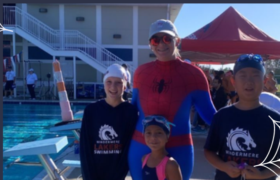
DRAGON SWIM ACADEMY KICK-OR-TREAT SWIM MEET

Dive into the Halloween spirit at our annual Pumpkin Meet! Expect traditional races and pumpkin-themed competitions and activities for our swimmers in Red group & above. Don't forget to come dressed in your costumes/spooky attire!