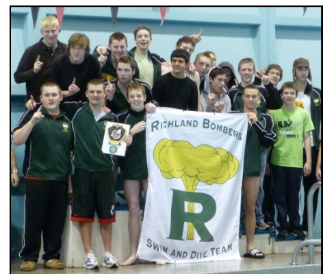
The Richland High School Boys' 4A Swim Team took FIRST PLACE at the District Championships!