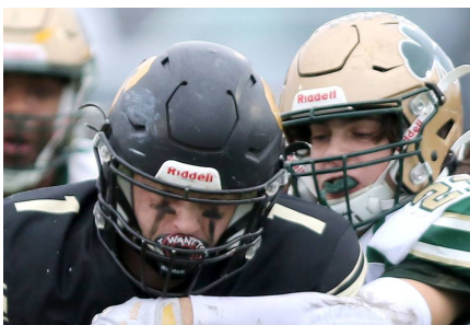
2022 season preview: Scouting the CCL/ESCC Purple division