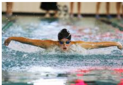
Articles filed under Crystal Lake Central Preps