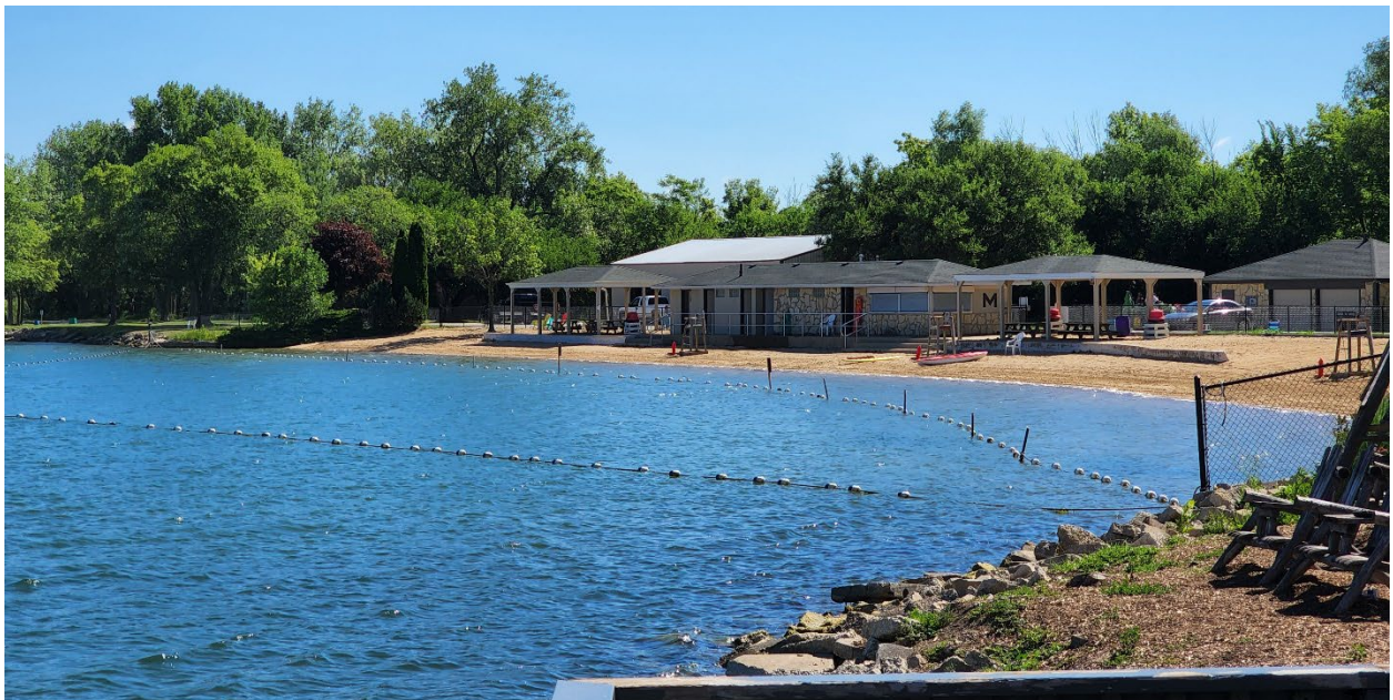
Figure 4: Lake Manteno beach access on east side of lake

The beach is located on the east side of the lake. This is where the start & finish will be for the athletes.