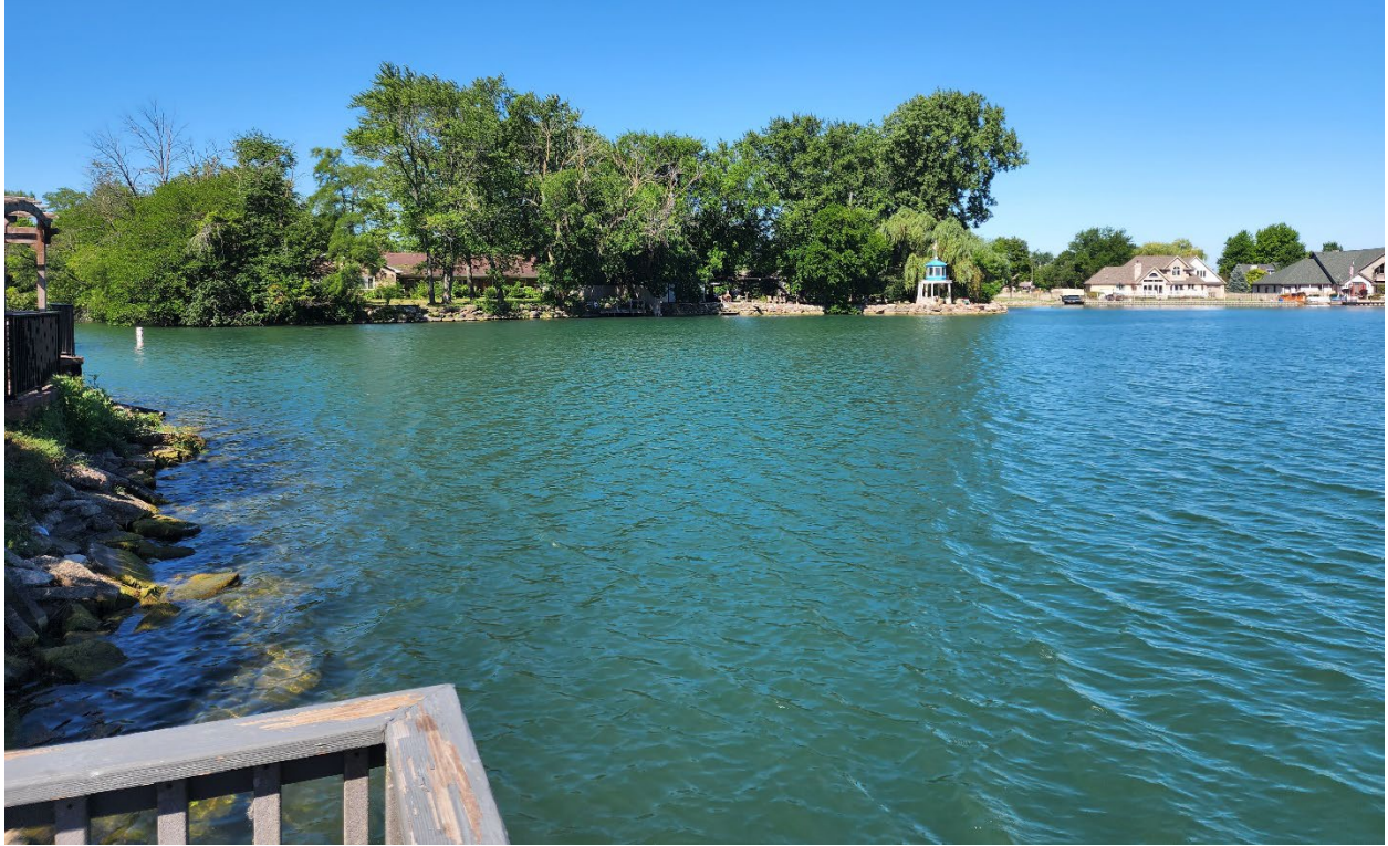
Figure 3: Lake Manteno, looking from west to south is the path to turn 1 from the start

The lighthouse is in the southend of the lake, turn 1 view.