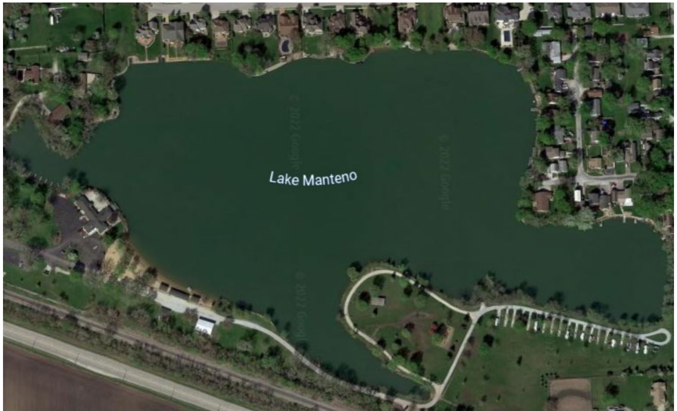
Figure 1: Google MAPS overhead view of Lake Manteno

Lake Manteno site in Manteno, IL provides a freshwater venue for performing open water swimming. The site has a private beach on the east side, private camp ground to the north, private houses to the west and the Sportsman's Club to the South. The following is the Google Maps image of the site: