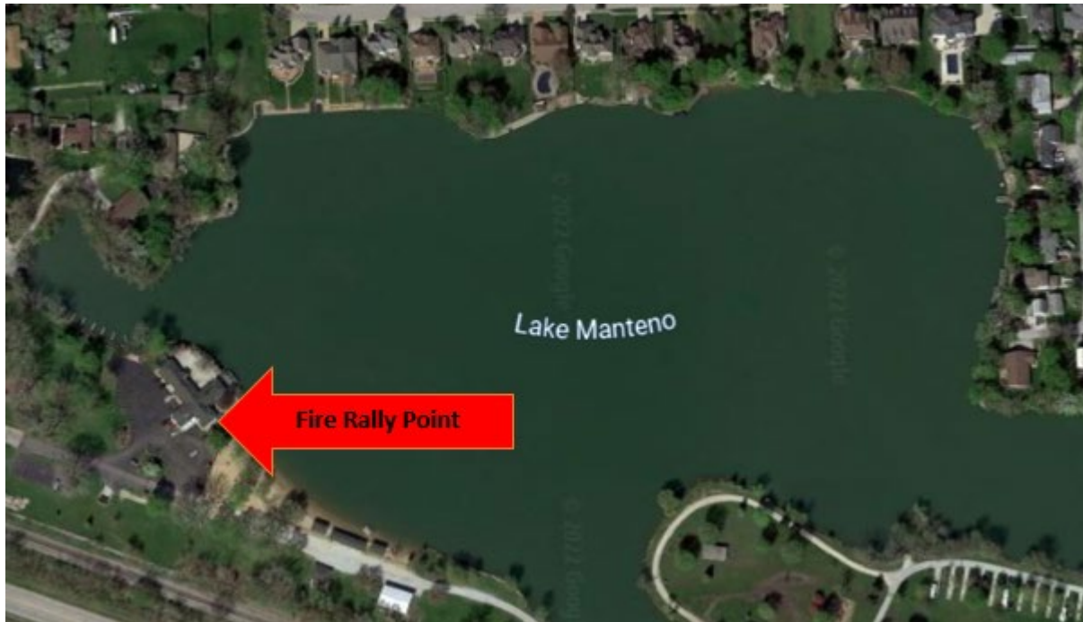
Figure 5: Fire Rally Point

Fire occurs can occur in two locations for the open water venue: on land and on the water.