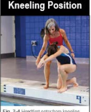
Fig. 7-4 Headfirst entry from kneeling position.