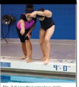
Fig. 7-6 Headfirst entry from stride position.