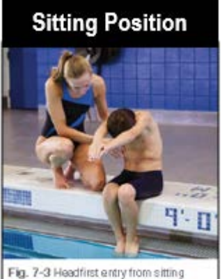
Fig. 7-3 Headfirst entry from sitting position.

(From the American Red Cross Safety Training for Swim Coaches manual)