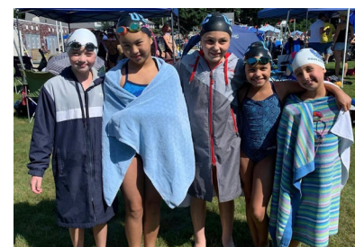
United Swim Club

In July, New England Swimming was finally able to return to championship meets, and it was amazing to see all of our athletes racing against one another again. Over the course of four weekends, athletes across the LSC raced at 13-14 Champs, 11-12 Champs, 15&Over Champs, and the 10 &Under Challenge. A very special thank you to Phoenix Swimming, Seacoast Swimming and Greenwood Swimming for hosting these outstanding championship meets! It was wonderful to see smiles on everyone's faces as well as having the opportunity to witness some very fast swims!