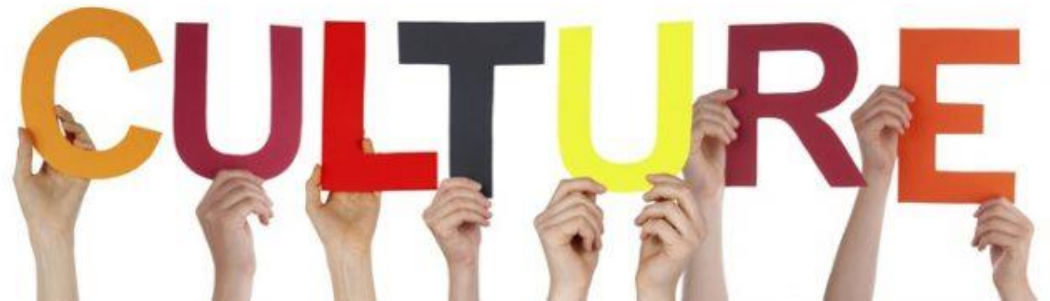
Working to Change