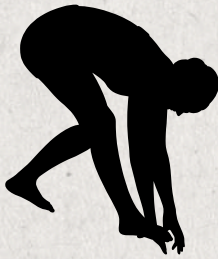
Luigi Silvestri (Gold)