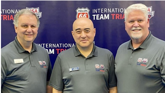
International Team Trials