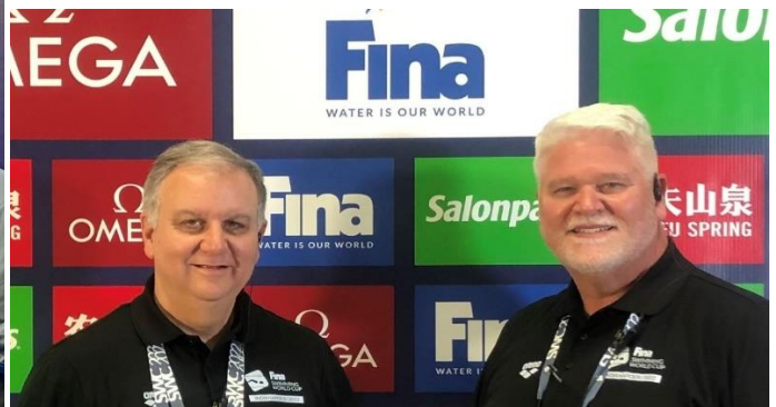
FINA World Cup