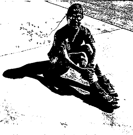
Members of the Barracuda Aquatics Team in El Paso, Texas, participate in the club's Swim-a-Thon fundraising efforts during the COVID-19 crisis.