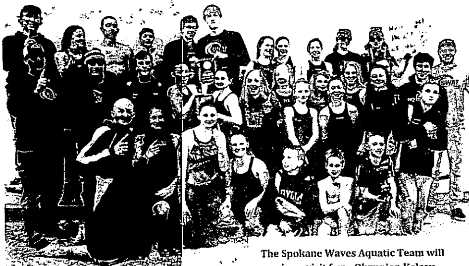
The Spokane Waves Aquatic Team will receive a visit from Olympian Kelsy Dahlia as the grand prize winners of the 2019 Swim-a-Thon contest. The team raised $32,920 last year, an all-time high for the club.

Four Gold Medal teams were entered into the grand prize drawing, earning their spot by receiving the most Swim-a-Thon points of all teams in their respective team-size categories.