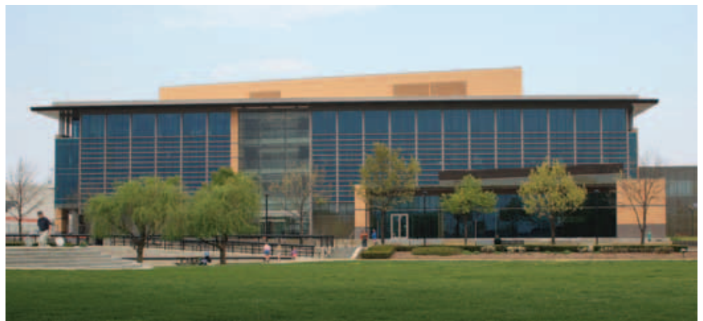
NCAA Brand Building Established 2012