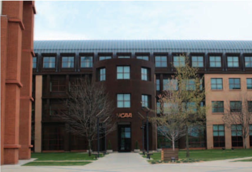
NCAA Dempsey Building Established 1999