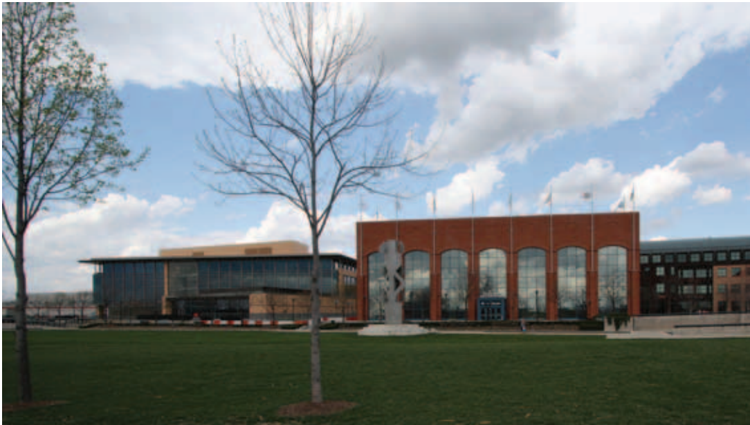
NCAA National Office and NCAA Hall of Champions