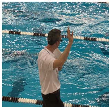
Below: MWYS officials and coaches at a long course meet at the Brown University pool.