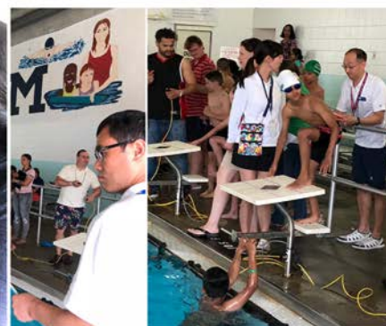
Many MWYS officials and volunteers helped during the meet.