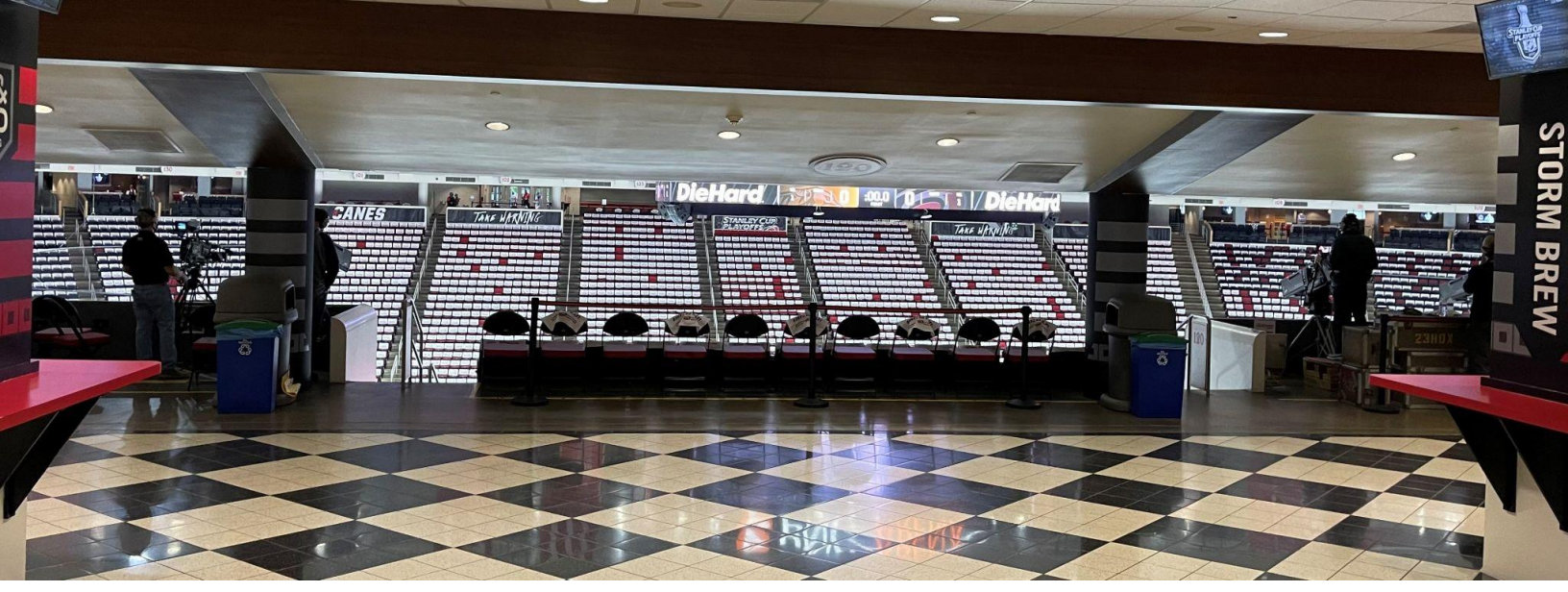
View from the Marlins of Raleigh concession stand S120 located in the Storm Brew Priority Lounge