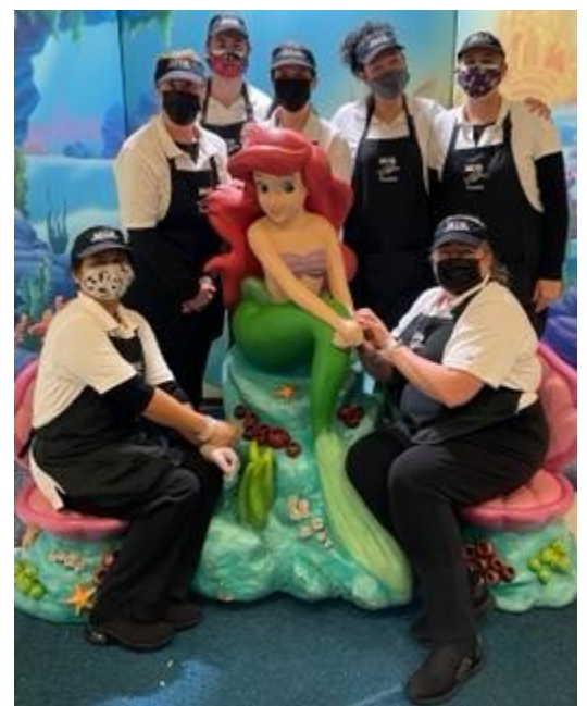
MOR parents and swimmer staffing a Disney on Ice event

Video view from stand, circa 2019: <a href="youtu.be/_yjRThAKMW4">yjRThAKMW4</a>