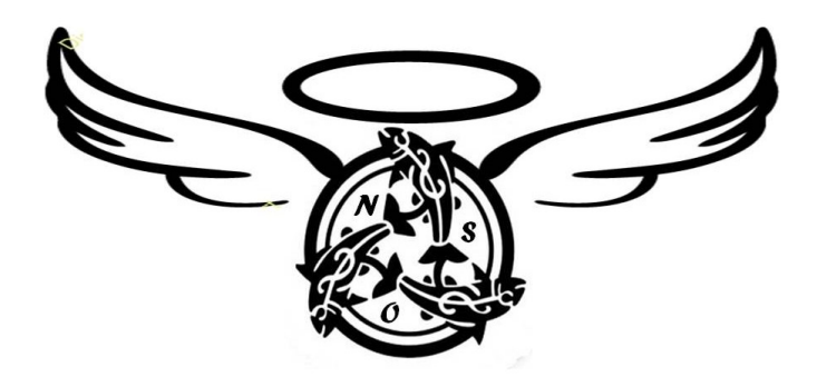
Good luck to the Bliss Fish Summer and Owen! You make us proud everyday!

Swim Hard, Swim Fast and Always Believe! -Love, Mom, Dad and Noah!