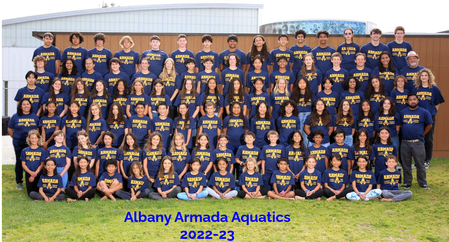
Albany Armada Aquatics 2022-23