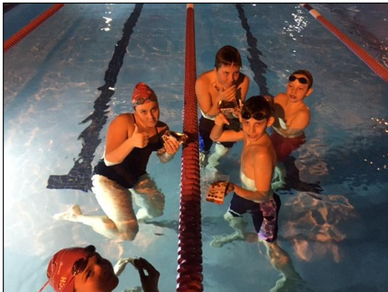
Group 4 enjoys a roasted seaweed snack during Winter Camp.

This training group works hard but also has a good time together and supports each other in their goals. One of the highlights of the week is our Tuesday Timed 50s (often swum on Wednesdays) where everyone swims a fast 50 yards of freestyle. The group has dropped 47 seconds collectively since the beginning of the season, and many now have sub-30 second 50s.