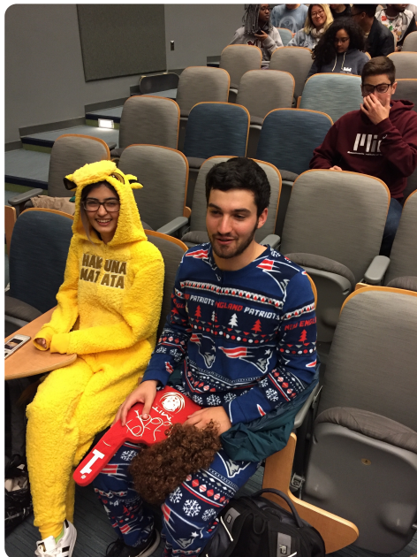
My 6.042 TA dressed up for a lecture example.