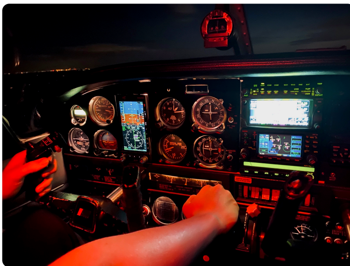
Back in the air during IAP