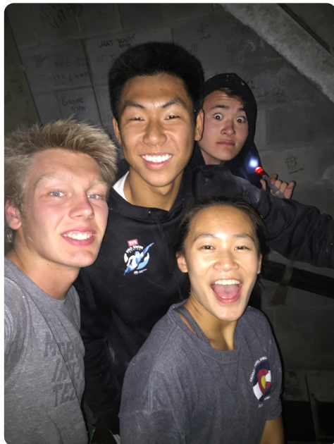
O-week with my fellow swimmers someplace that we shouldn't be.