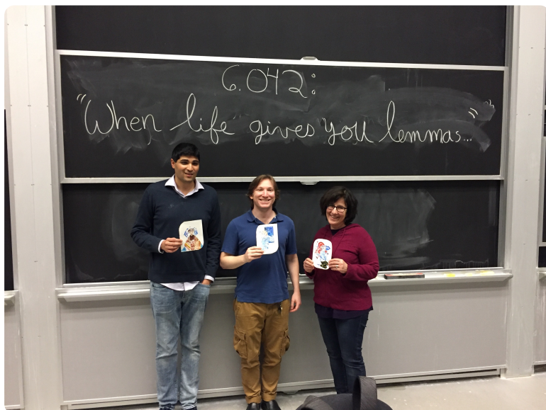
End of 6.042, with the professors holding portraits of them self's made by an enterprising student.