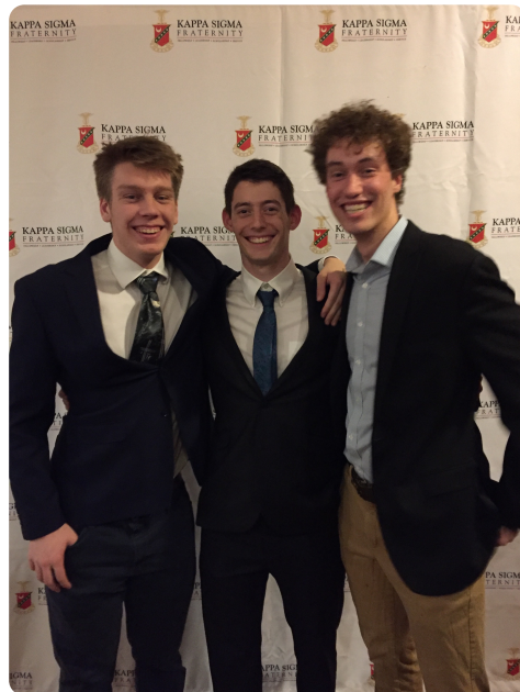
My family line. I borrowed a coat, and it shows.