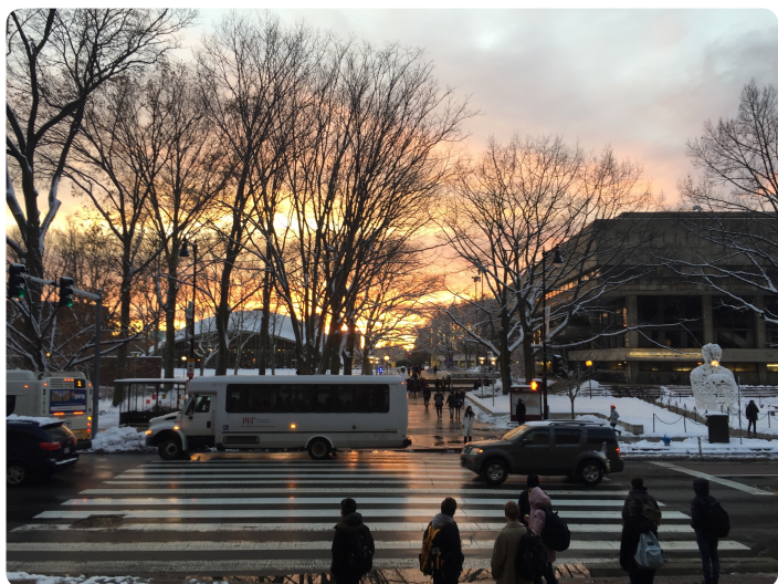
Beginning of winter sunset headed back to the dorm