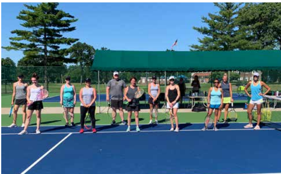
Cardio Tennis Social Distanced Style!