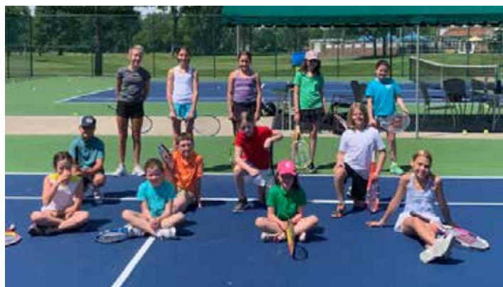
Stars class session #1