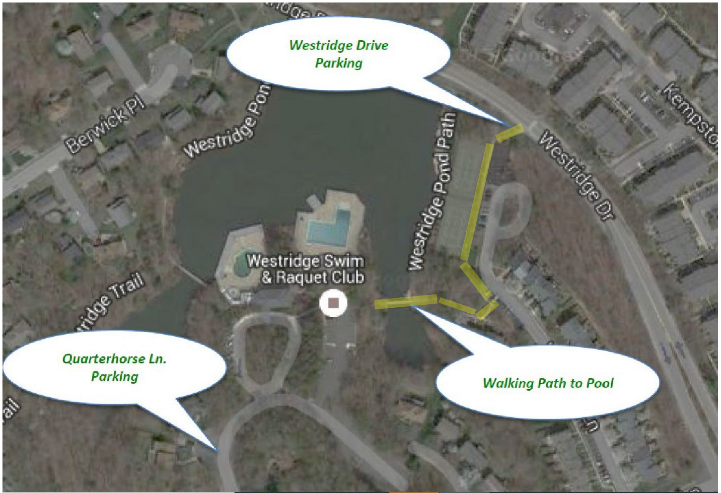
Figure 3: Alternative Parking View

Additional Parking: Additional parking is available along Quarterhorse Lane, but please do not block driveways. Parking is also available along Westridge Drive and a walking path to the pool, highlighted above, is located around the pond.