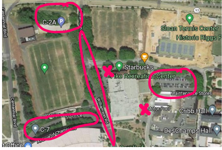
(there is no Starbucks by Fike!)